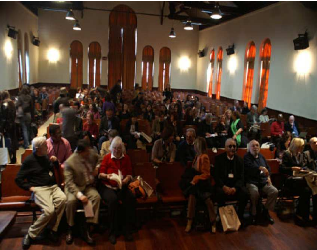
Plenary sessions, as well as panel presentations, were well attended.