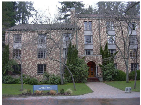
College Hall National Office site at WWU

The NAES Board of Directors will meet at the National Office host campus, Western Washington University, on October 26 and 27. The main focus of the meeting will be the upcoming Atlanta conference.